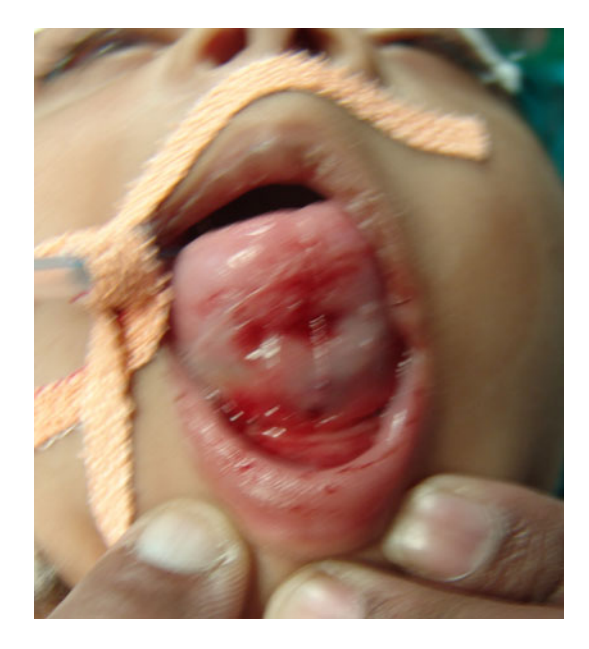
Fig. 1 Clinical Photograpah showing sublingual cyst elevating the tongue

Intraoral swellings are uncommon in the newborn age [1-5]. Macroglossia, duplication cysts, lymphangioma & hemangiomas of tongue and lymphatic cyst of floor of mouth, tumours arising from hard & soft palate, teratodermoids are